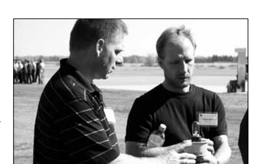
Attendees examine light fixtures during the Pine River Regional Airport tour.

Participants were allowed to try four types of launchers, each of which has a specific use in the field for hazing birds and wildlife. This hands-on session was an introduction to the more detailed workshop that was presented the next day by Ostrom and his staff (see related article, page 1).