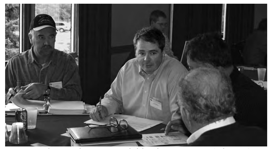
Participants in the Project Closeout session worked through an exercise on FAA fund request forms.

According to a July 2005 rule change, final grant funds will be released only after submittal of the closeout reports. This change was implemented to encourage airport sponsors to complete the closeout process, Nistler said. Participants raised concerns over this process not only being retroactive, but also hurting